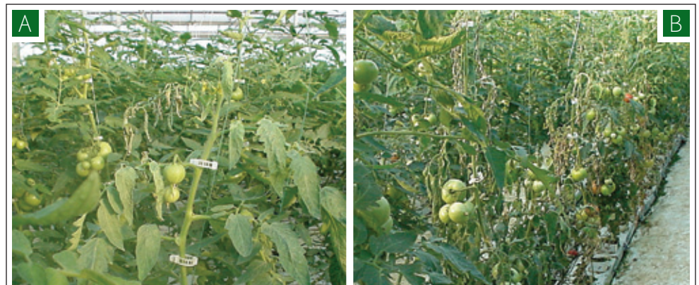
Figure 7. A) Early and B) advanced leaf scorch symptoms typical of bacterial canker in greenhouse tomatoes.

■ Pruning, harvesting and other handling operations: Greenhouses should be kept clean and thoroughly disinfected between crops. Hands and tools should be sanitized between plants or rows with a disinfectant solution to minimize pathogen spread. Clippers and knives that deliver a disinfectant to the cutting surface during each cut are commercially available, and when used with an effective disinfectant, such as Virkon or KleenGrow, can also help to prevent the spread of Cmm. Knives or clippers that do not deliver a disinfectant are not recommended for pruning, suckering or harvesting. These