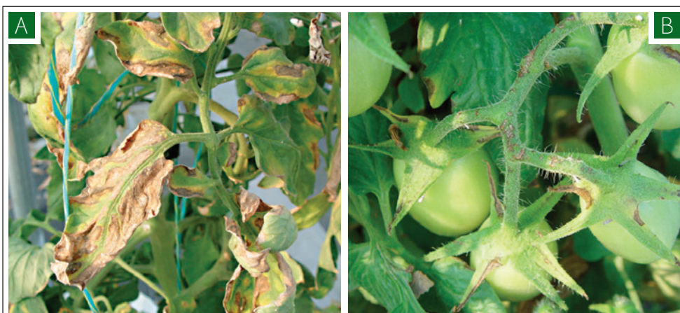
Figure 1. A) Leaf necrosis often called “firing”. B) Peduncles and calyx illustrating necrotic lesions.

opened, yellowing or browning caused by the decay of the tissues may be seen. In the greenhouse, bird’s-eye spots are typically not observed, but fruit may appear netted or marbled, or they may remain symptomless.