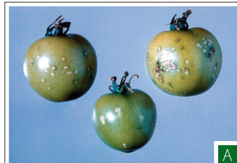
Figure 2. A) Bacterial canker on green tomato, showing the typical white to yellow halo or “bird’s-eye” symptom. B) The red tomato shows some brown spots surrounded by a white halo caused by Cmm. The darker brown spots (with no halo) are caused by a different bacterial pathogen, Pseudomonas syringae pv. tomato.

Fruit: Small dark spots on the fruit surrounded by a white halo or “bird’s-eye” spots are characteristic of bacterial canker on field-grown fruit. Spots become raised and the centers turn brown with age. Infections, and the resulting spots, occur when Cmm bacteria are deposited on fruit by splashing water from rain or overhead irrigation, or mechanically during handling of the plants. When internally infected fruit are