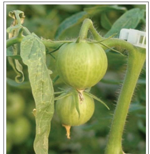
Figure 5.) Typical netting or mottling symptoms of bacterial canker on tomato fruit produced in a greenhouse.