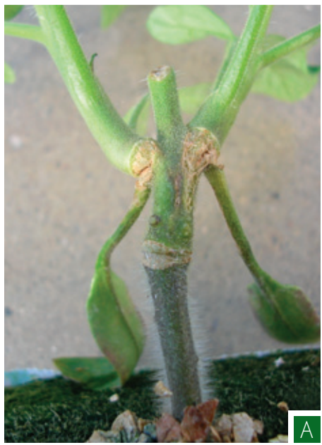
Figure 6. A and B) Typical stem lesions on young plants. Note the graft site.