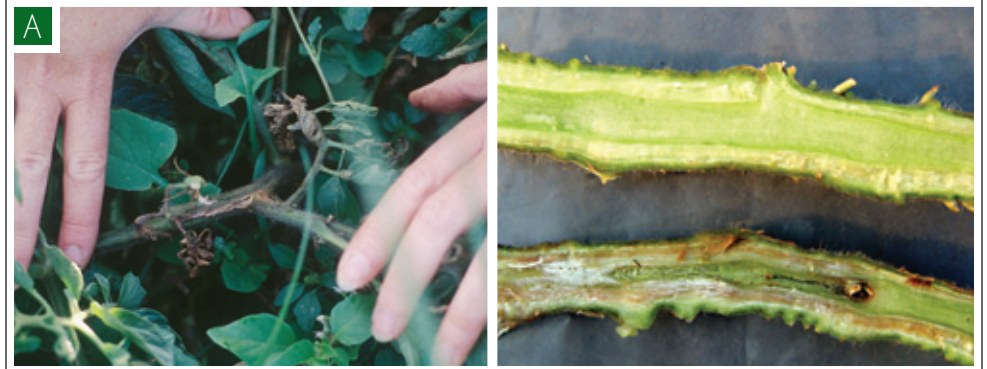
Figure 3. A) Stem illustrating classic stem canker symptom. B) Comparison of healthy (top) and diseased stem (bottom), which shows dark discoloration and cavities in the pith area.

Environmental conditions favoring disease development. Development of bacterial canker is favored by warm - 75-90 F (24-32C) - moist conditions. In greenhouses, the disease tends to be more severe in the summer during long, hot days when plants are stressed. Bacterial canker is more likely to be found in wetter areas of the greenhouse