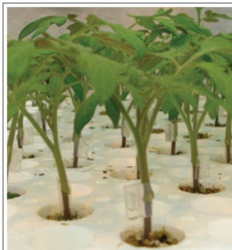
Figure 4.) Young seedlings after grafting. Note the conditions that promote graft healing can also promote bacterial infection.

In the greenhouse, Cmm may move from infested to non-infested areas in re-circulated water and from plant to plant in bags or trays. Equipment such as clippers, cutting blades, stakes or plant ties may harbor the pathogen. Workers may transmit the bacteria on tools, hands and clothing. During pruning and grafting, improperly disinfected tools may lead to disease spread. This spread can be particularly explosive following the grafting operation, when bacteria can be directly introduced into the vascular tissue of